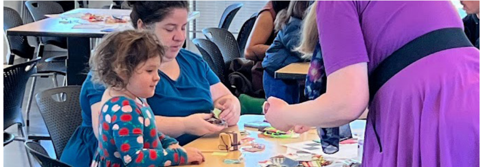
Studio and Storytime at Tacoma Art Museum.

Play to Learn | BABY AND PRE-K Thursdays at 10 a.m. and 1 p.m. February 6, 13, 27 For children and caregivers to enjoy play together. Presented by Greentrike, funded by Tacoma Creates, and hosted by TPL.