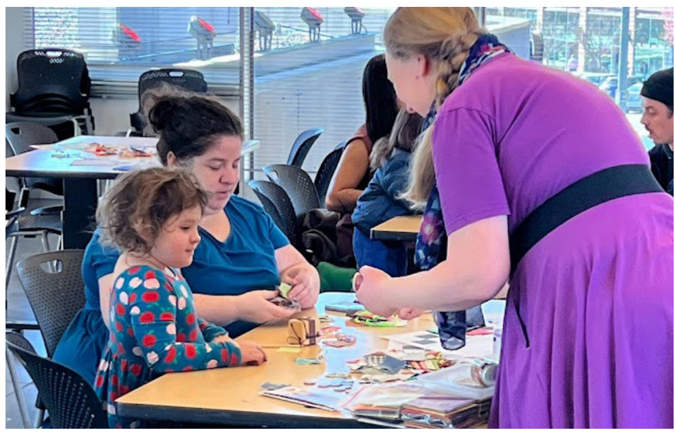
Studio and Storytime at Tacoma Art Museum.