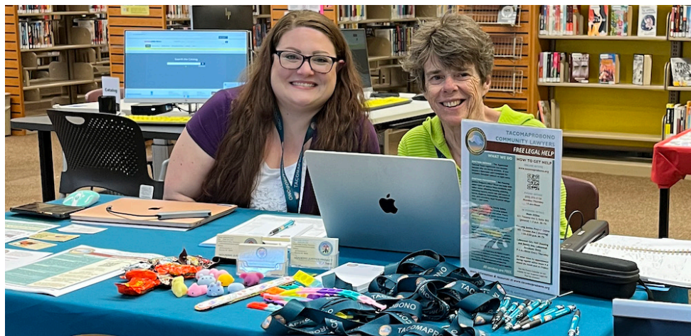
Free legal aid with tacomaprobono.