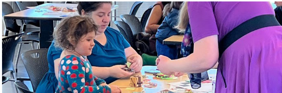
Studio and Storytime at Tacoma Art Museum.