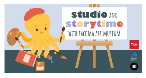
Studio and Storytime with Tacoma Art Museum | AGES 2–8 Saturday, Oct. 19 at 11 a.m. TAM (1701 Pacific Avenue) Read a story, explore art in TAM's galleries, and create a hands-on project in TAM's studio! Presented by TAM and TPL and funded by Tacoma Creates.