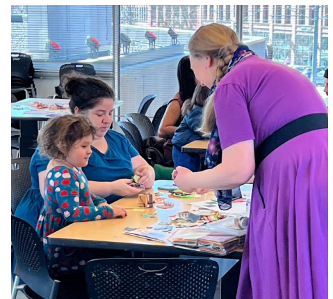
Studio and Storytime at Tacoma Art Museum.